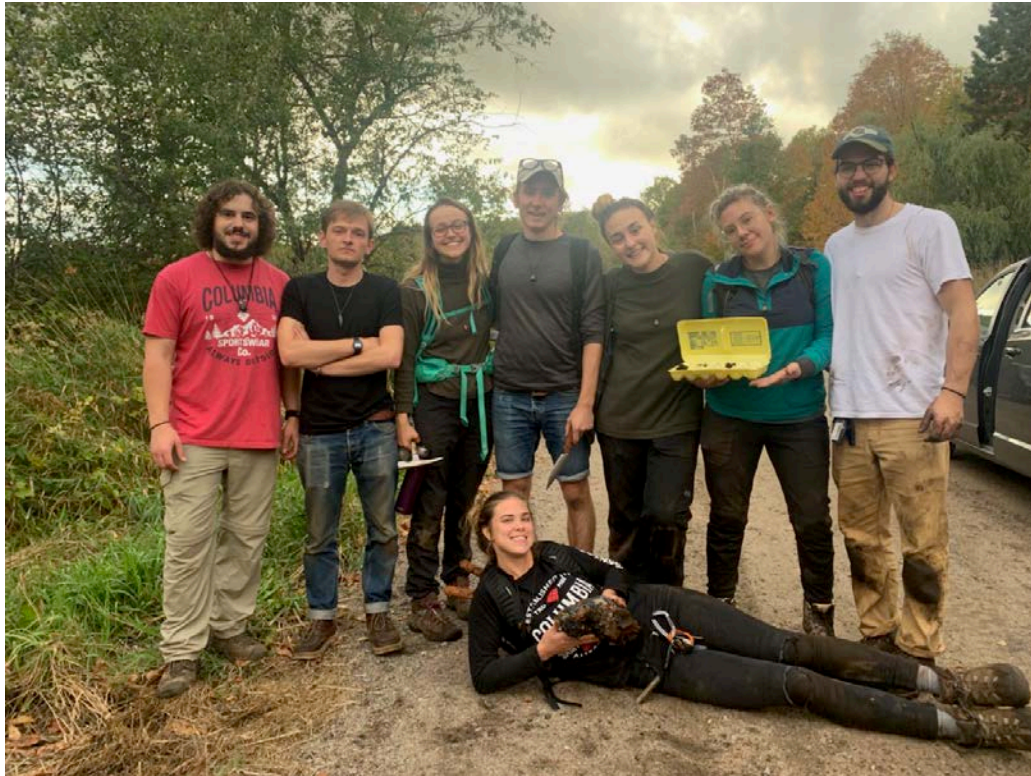
A group of members in Bancroft, Ontario. They were aids on the annual Mineralogy class field trip. They did some personal collecting and helped stock the clubs supply of minerals for sale. Sept. 28 th , 2019.