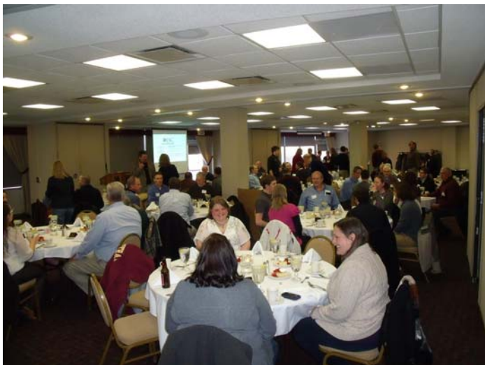
Members enjoyed a social hour and dinner before the speaker's presentation while attending the March 14, 2013 meeting.

On March 14, 2013 the Michigan Section held its first Section meeting of the year at Central Michigan University in Mt. Pleasant. Approximately 80 members and non-members attended the meeting. Good participation from the CMU Student Chapter contributed to the good attendance, with about a dozen students and faculty in attendance.