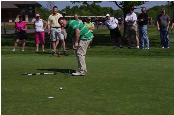
Golfers trying their luck at the putting contest.

2012 was a successful year for our Eighth Annual AIPG Michigan Chapter Golf Outing. 86 players enjoyed a day of golf and camaraderie for this year's event. Proceeds from this event continue to support our K-12 educational grants.