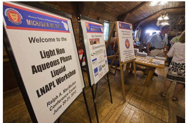
Registration for the Workshop on July 20 th.

The American Institute of Professional Geologist (AIPG) – Michigan Section held a light non-aqueous phase liquids (LNAPL) Workshop on June 20 and 21, 2012 at the Ralph A. MacMullan Conference Center located at 104 Conservation Drive on the north shore of Higgins Lake in Roscommon, Michigan. This Workshop was endorsed by the Michigan Department of Environmental Quality, but was not MDEQ sanctioned training.