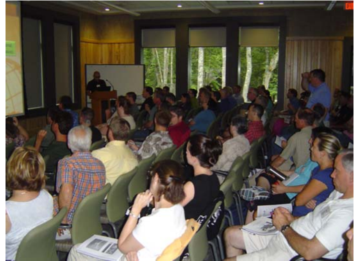
Attendees absorbing details of one of the second day's breakout sessions.

and assess LNAPL subsurface behavior, develop and justify LNAPL remedial objectives including maximum extent practicable considerations, select appropriate LNAPL remedial technologies and measure progress, and use ITRC's science-based LNAPL guidance to efficiently move sites to closure.