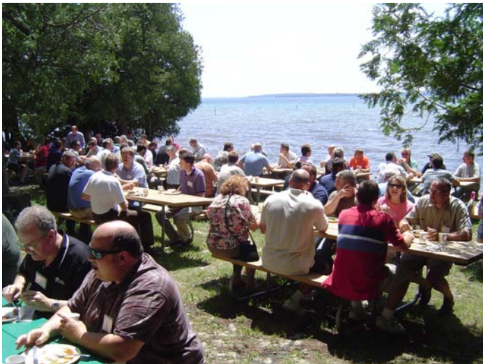
Attendees enjoying a barbeque lunch on the shore of Higgins Lake.

196 attendees heard presentations on development of a site's LNAPL Conceptual Site Model, LNAPL stability analysis and LNAPL recoverability evaluation. The cross section of speakers included representatives from academia, industry, regulatory, and consulting that presented the perspective of how information regarding LNAPL stability and recoverability is used to develop a realistic and effective conceptual site model used to establish remedial endpoints at a site. AIPG Michigan Section would like to thank all who attended the workshop and encourage you to share the knowledge gained at this informative presentation.